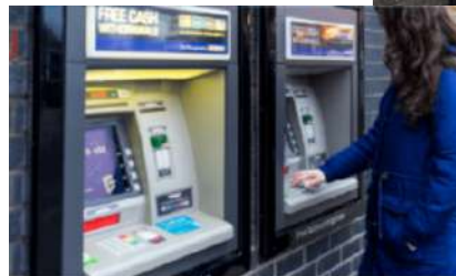
Cash points / ATM